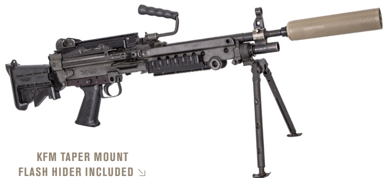
KFM TAPER MOUNT FLASH HIDER INCLUDED