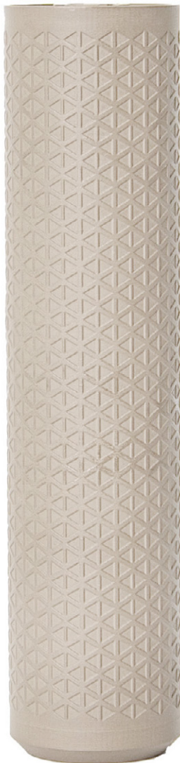
BREATHABLE FRONT PLATE DESIGN