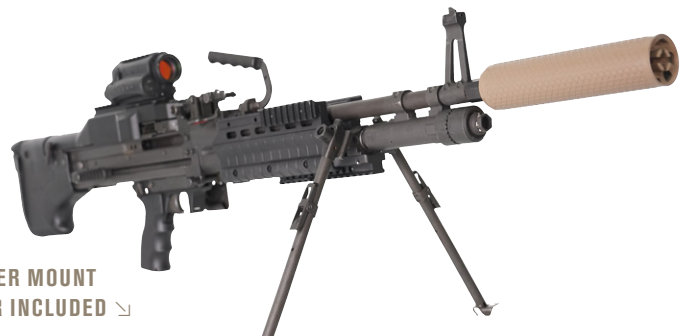
KFM TAPER MOUNT FLASH HIDER INCLUDED