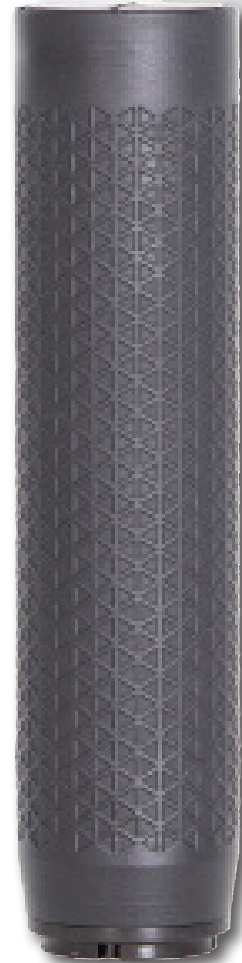
Suppressor pictured with factory installed HUB mount