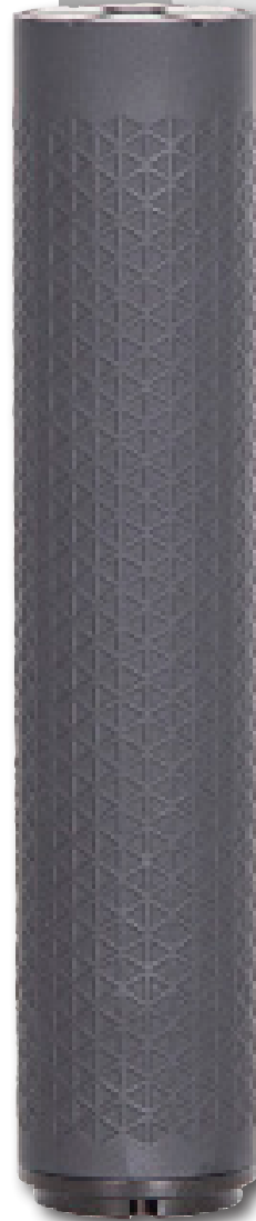
Suppressor pictured with factory installed HUB mount