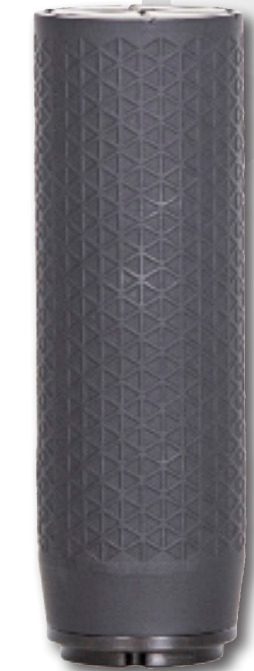
Suppressor pictured with factory installed HUB mount