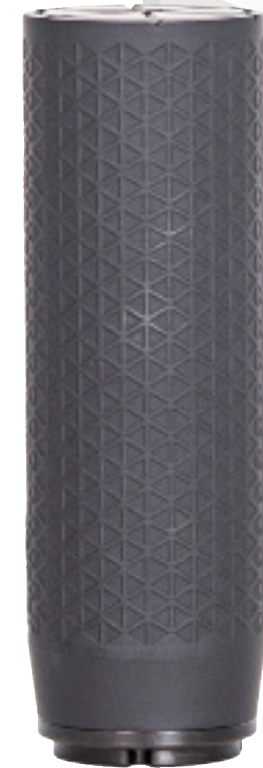
Suppressor pictured with factory installed HUB mount