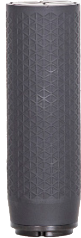
Suppressor pictured with factory installed HUB mount